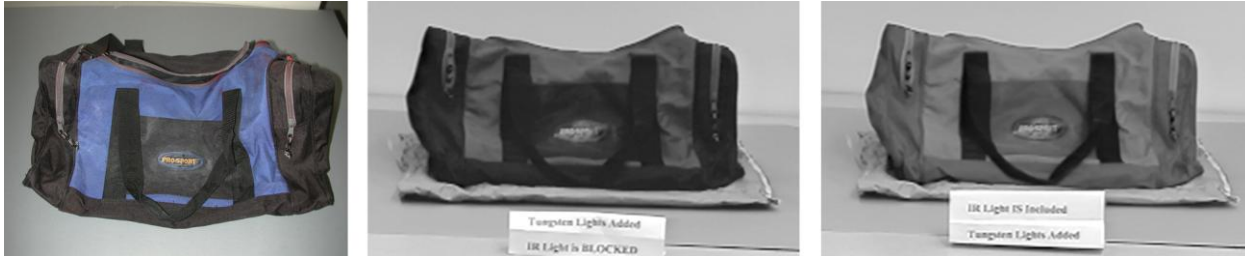
Figure 1. This figure demonstrates differences in the appearance of an object when the camera has a different spectral response. (Left) Color photograph. (Center) Video still from black and white camera with IR blocked out. (Right) Video still from black and white camera with IR allowed to pass.

This reconstruction may consist of photographing the object under comparable conditions as seen in the questioned image or otherwise duplicating them by real or virtual means.