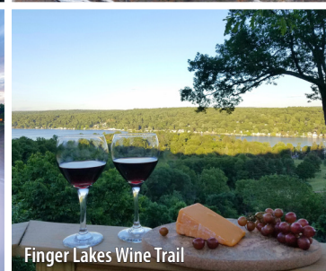
Finger Lakes Wine Trail