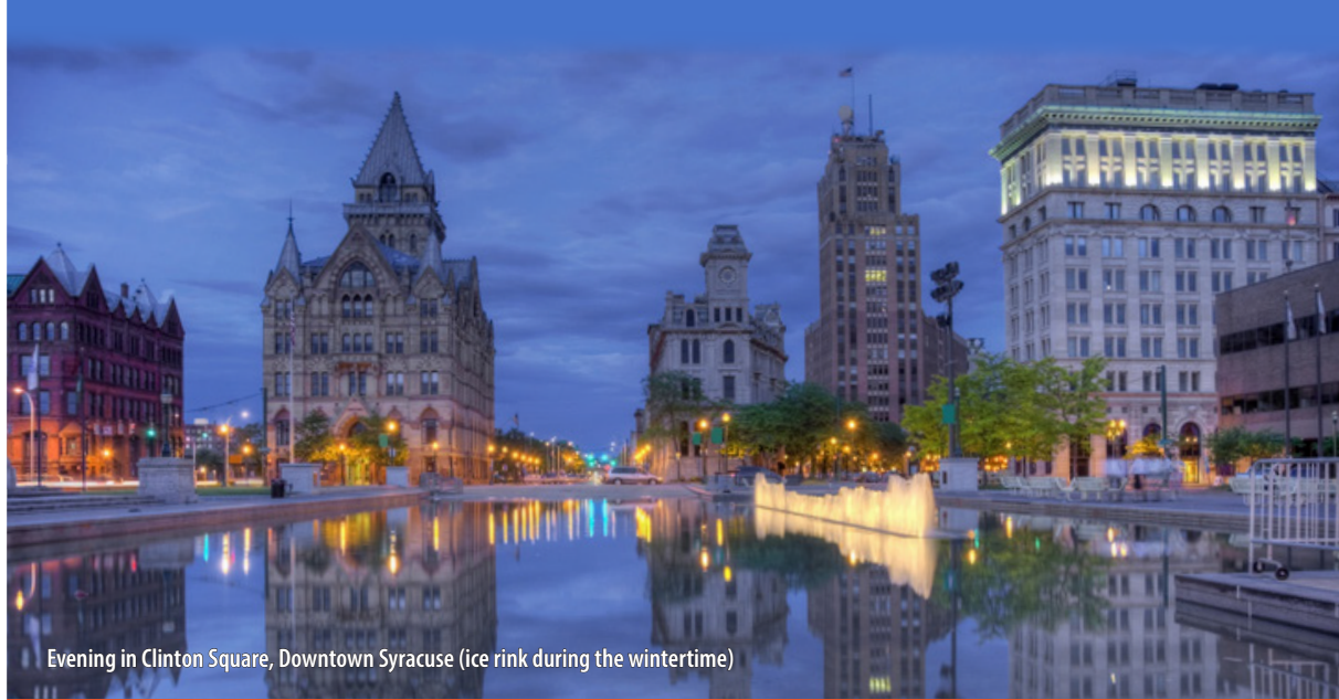
Evening in Clinton Square, Downtown Syracuse (ice rink during the wintertime)