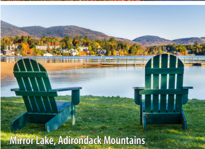
Mirror Lake, Adirondack Mountains