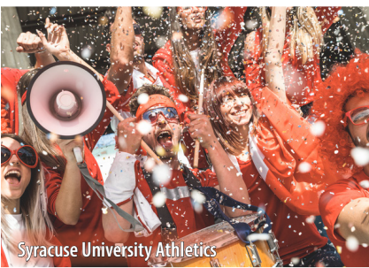
Syracuse University Athletics