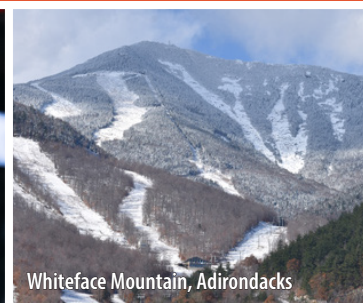
Whiteface Mountain, Adirondacks