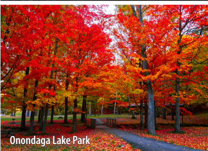
Onondaga Lake Park