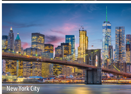
New York City