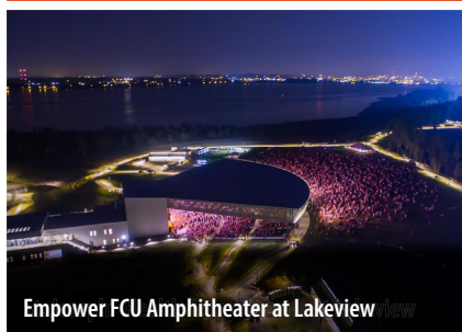
Empower FCU Amphitheater at Lakeview