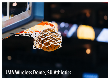
JMA Wireless Dome, SU Athletics