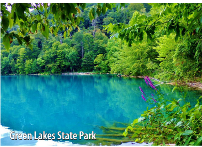
Green Lakes State Park