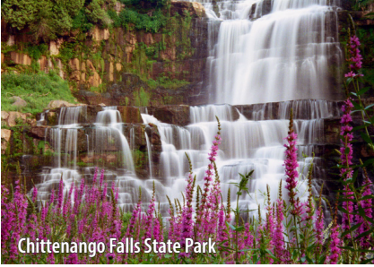
Chittenango Falls State Park

From tech, the arts, cultural events, and beautiful natural surroundings to sports and seasonal outdoor activities, Onondaga County is a great place to live, work, play, and raise a family.