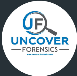
an Uncover Forensics training course

This course is taught online in a self-paced format including prerecorded lectures and web-based quizzes. Attendees may take this class from any location, at any time of day, and may stop and restart as needed.